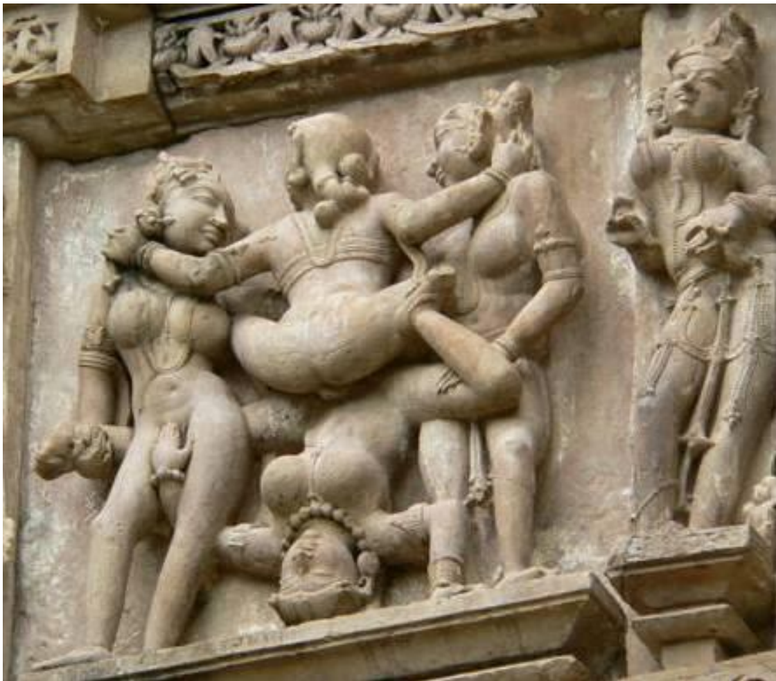
Fig. 2: Khajuraho. Photograph taken by Bony Mitra, 2005. Personal Collection

Hindu nationalists were also anxious about their 'queer past'. The western epithet of India being the 'land of the Kamasutra ' was met with unease and shame. These anxieties, as I have explained were a response to the colonial educationist's attacks on the constructs of Indian masculinity and sexuality. Temple sculptures from Konarak and Khajuraho to the Kamasutra and other ancient literary materials contain enough references to evidence that ancient India accommodated a whole range of sexual behaviours. This contradicts the Hindu nationalist belief that monogamous heterosexual marriage is the only form of permissible sex and all other forms of sex were introduced through the Westerners. Nehru, the first Prime minister of independent India went so far as to claim 'that homosexual behaviour